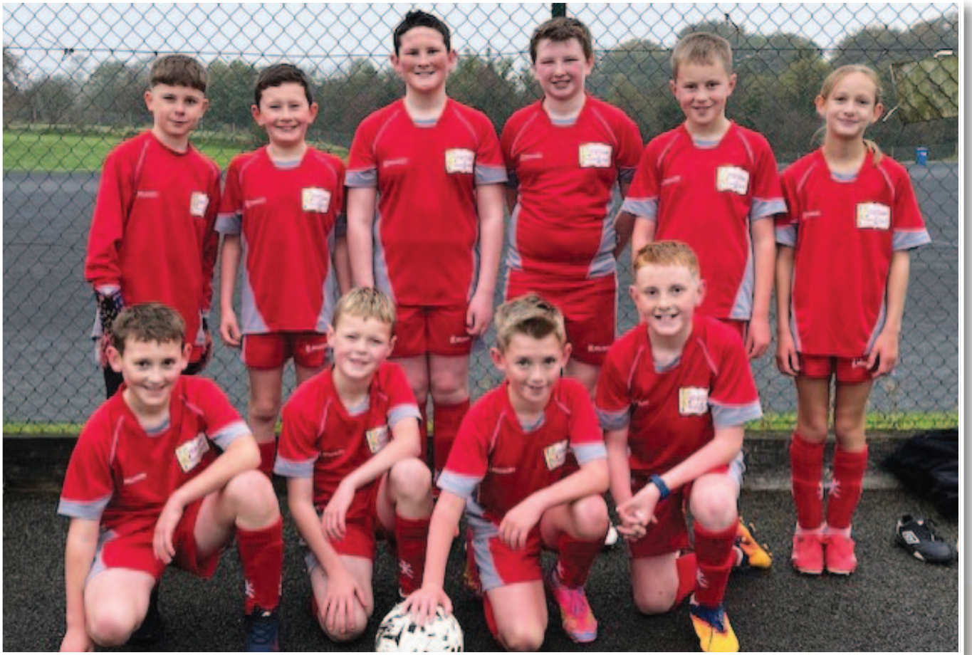
Boys' Football Team