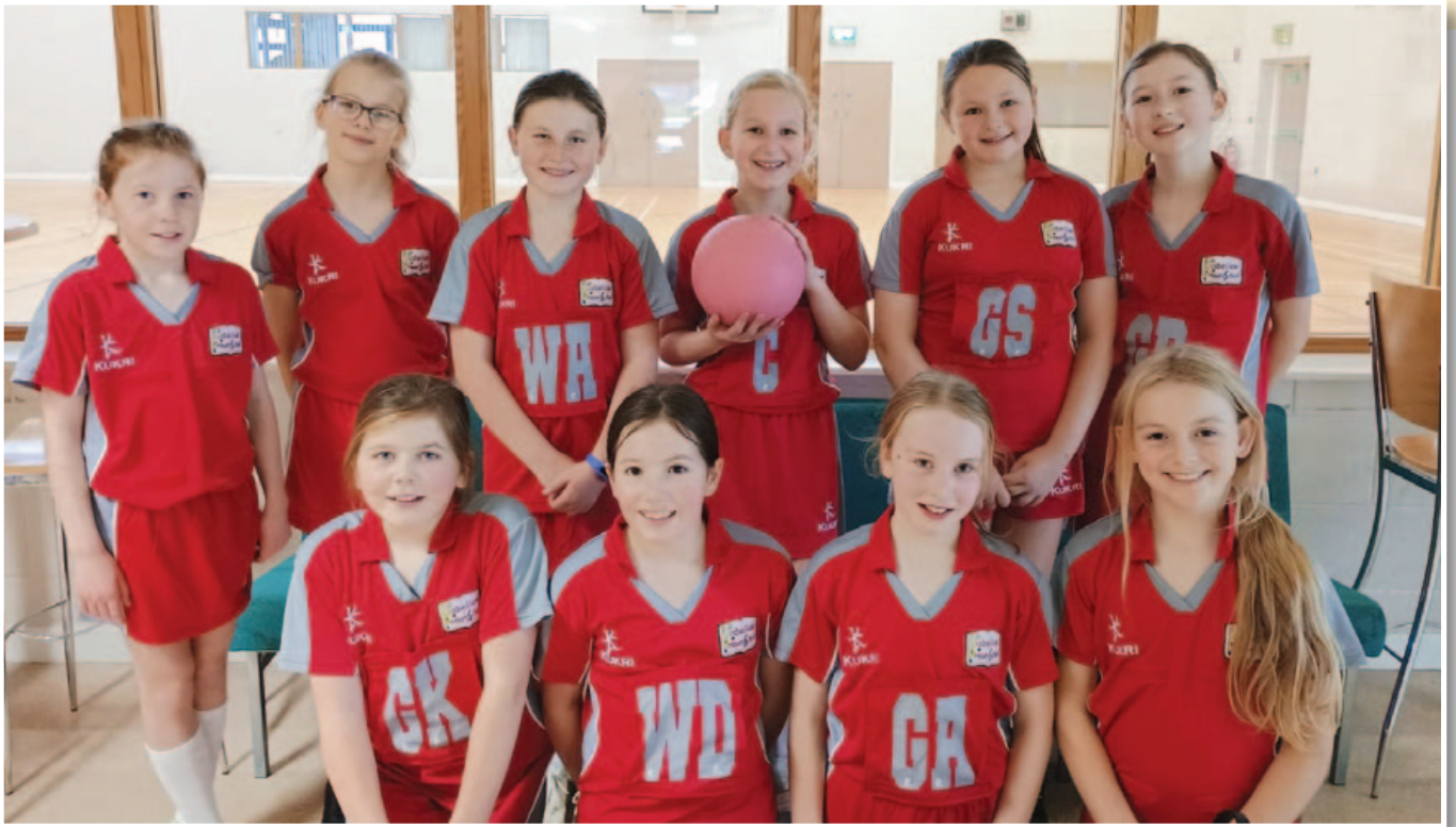
Girls' Netball Team